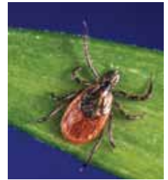
Female Deer Tick