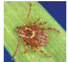
Female American Dog Tick