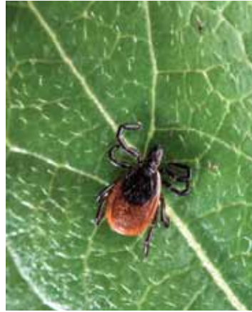
Adult Deer Tick

Ticks will attach themselves anywhere including the thighs, groin, trunk, armpits and behind the ears. If you are infected, the rash may be found in one of these areas.