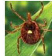
Female Lone Star Tick