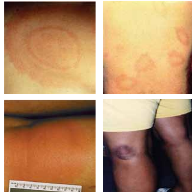
Examples of Erythema Migrans Rash

If you think you have Lyme disease, you should see your health care provider immediately. Early diagnosis of Lyme disease should be made on the basis of symptoms and history of possible exposure to ticks. Blood tests may give false negative results if performed in the first month after the tick bite.